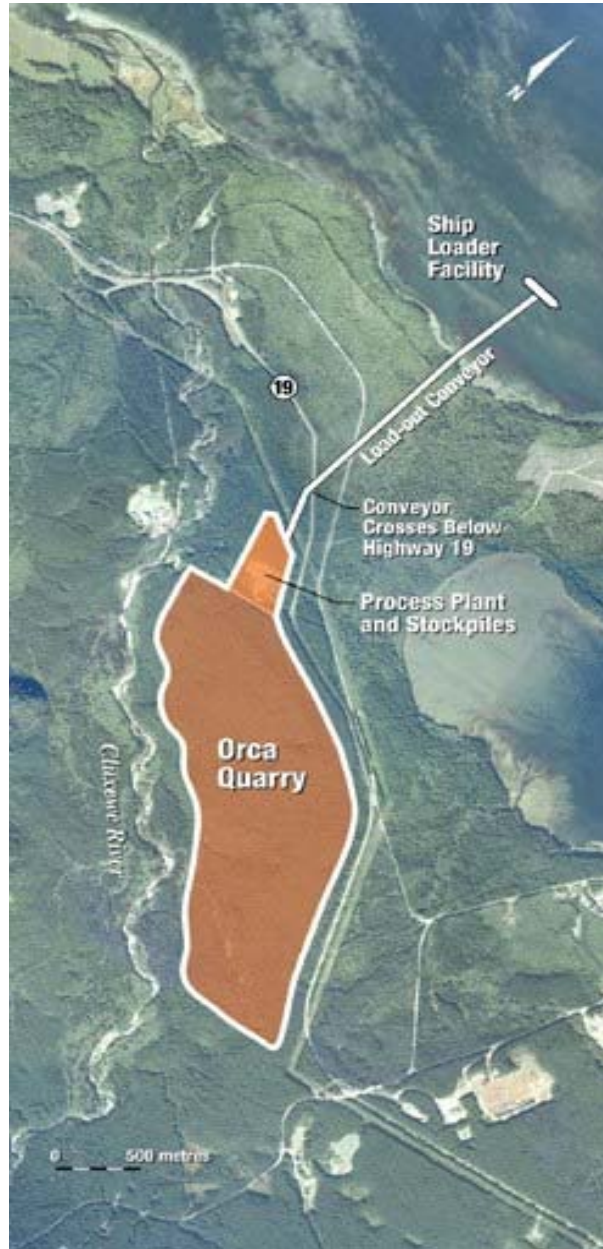
Orca Quarry located 3.8km west of Port McNeill on the Northwest Coast of Vancouver Island.

Many details about this case study were reported in a 2008 Centre for Indigenous Environmental Resources (CIER) report, which beat the authors of this report to showcase the Orca Sand and Gravel EA as standard-setting. The authors of this report confirmed with two Namgis EA Team members that the CIER (2008) report adequately represented the Orca Sand and Gravel EA process and it was recommended to use the information unchanged for this report.