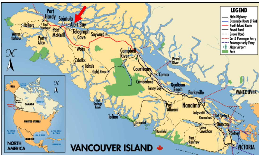
Map of location of Alert Bay (red arrow) on Cormorant Island and the Orca Quarry 3.8km west of Port McNeill

- Namgis Membership and Location: The Namgis First Nation consists of approximately 750 Namgis citizens on reserve and 500 off reserve. The Namgis reserves and the traditional and claimed territories are located in the vicinity of Alert Bay on Cormorant Island across from Port McNeill on the northeast coast of Vancouver Island (see following Map).