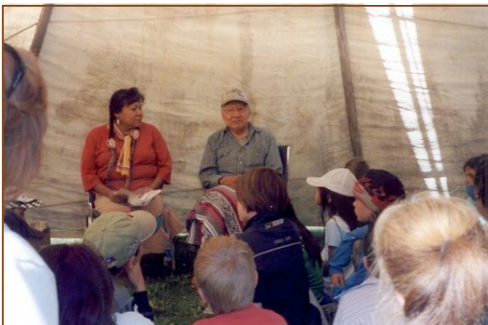
Canim Lake Elders telling stories to youth.